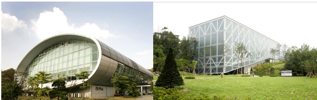
POSCO Sports Center