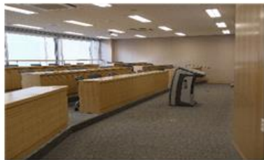
Lecture Theatre, 3F, 4F, Bldg. 57-1