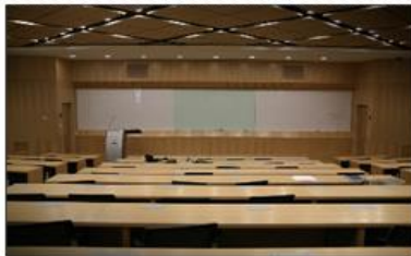
<SK Conference Hall, 1F>