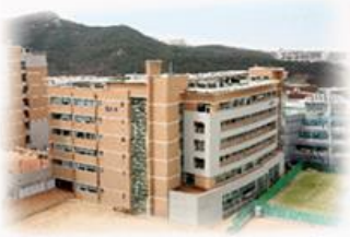
Whole view of GSPA Bldg. 57-1