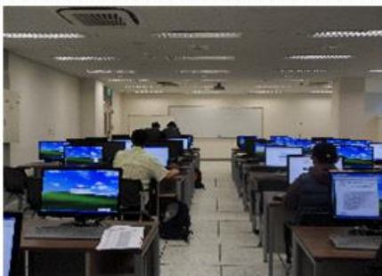
Computer Lab, B1