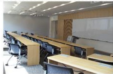
Lecture Theatre, 1F, Bldg. 57-1